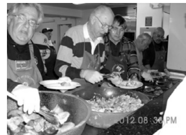
Part of the kitchen crew at the Tri-Tip in the Rain Dinner