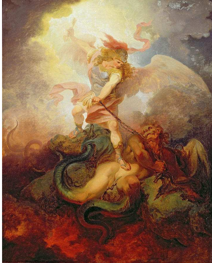
Jacques de Louthembourg - The Angel Binding Satan ca. 1797

“Then I saw an angel come down from heaven, holding in his hand the key to the abyss and a heavy chain. He seized the dragon, the ancient serpent, which is the Devil or Satan, and tied it up for a thousand years and threw it into the abyss, which he locked over it and sealed, so that it could no longer lead the nations astray until the thousand years are completed.” – Rev. 20: 1-3a