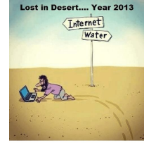
Must. Have. Internet.